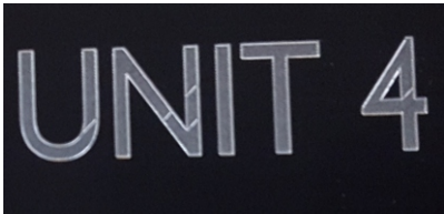
Black Matte Aluminum Black Shiny Aluminum also