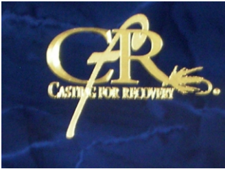
Blue Marble Brass