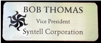
Silver Satin Brass