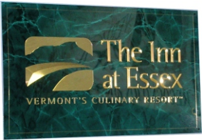
Green Marble Brass